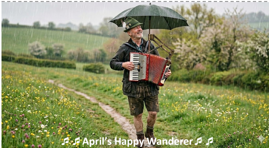
♪♪ April's Happy Wanderer ♪♪