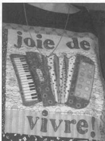
Spotted on Taffy Steffen's T-shirt (by Gypsy Squeezewear)