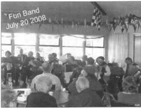
The Fun Band