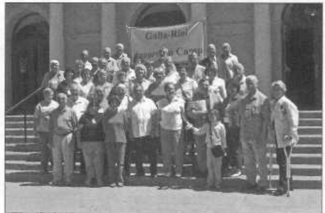
Camp Photo 2008