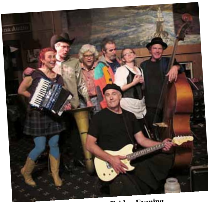
The Mad Maggies perform Friday Evening in front of the Rohnert Park Library — pg. 4

Intro to Piano Accordion Workshop Class every Saturday at 4 p.m. $20. The Accordion Apocalypse Repair Shop in San Francisco 255 10th St., San Francisco, CA