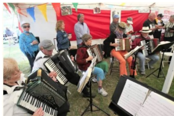
Jam Tent players. 9:30am-5:00pm All musical instruments are welcome.

This year's Jam Tent presents a variety of fun activities. Whether you play in the tent, lead a session, enter a raffle or buy an inexpensive, good reliable accordion, you'll learn a lot about accordions. The Jam Tent is a vast umbrella that can help you enjoy the festival even more! Every activity is tied to supporting scholarships for up-and-coming accordion students who will be seen on the festival stage as they grow up and advance in their skills. In the meantime, the Jam Tent can keep you informed about what we are planning and how students will be featured in and around the Jam Tent.