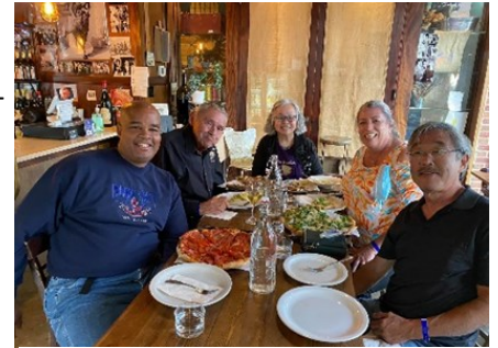
SFAC members at Cibo Rustico, 2021