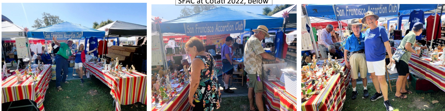
SFAC at Cotati 2022, below

We are very proud of our rich history, ongoing musical programs, and our commitment to propagating and supporting accordion culture best we can. We will have oodles of sheet music and accordion-themed figurines for you to make your own - make sure to stop by!