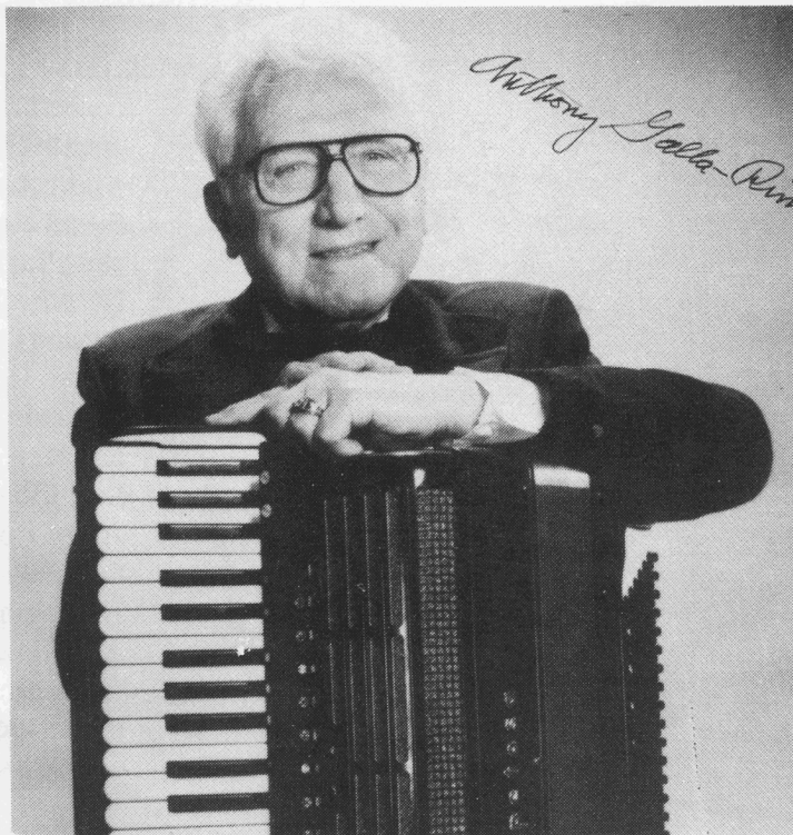
Our Honored Guest