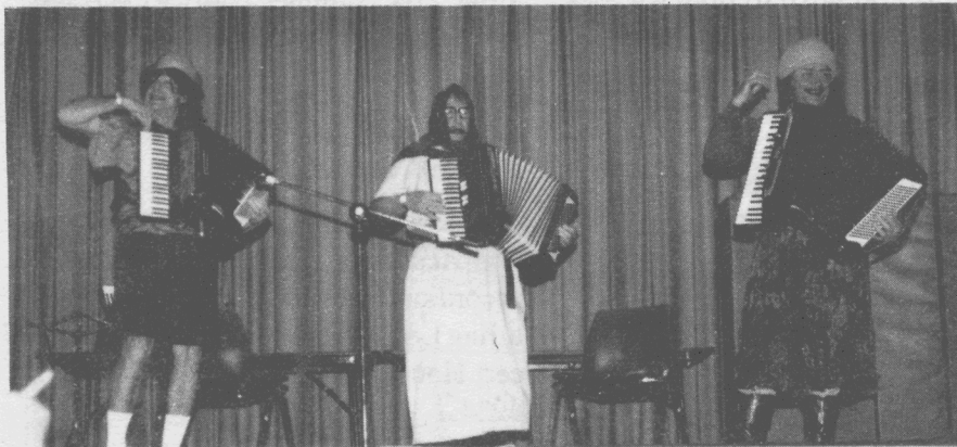
Special Guests Feminili Siciliana

The first group up after the intermission was the trio known as "Feminili Siciliana." Billed as stars