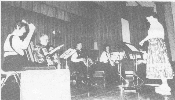
Chamber Quintet Plus One!