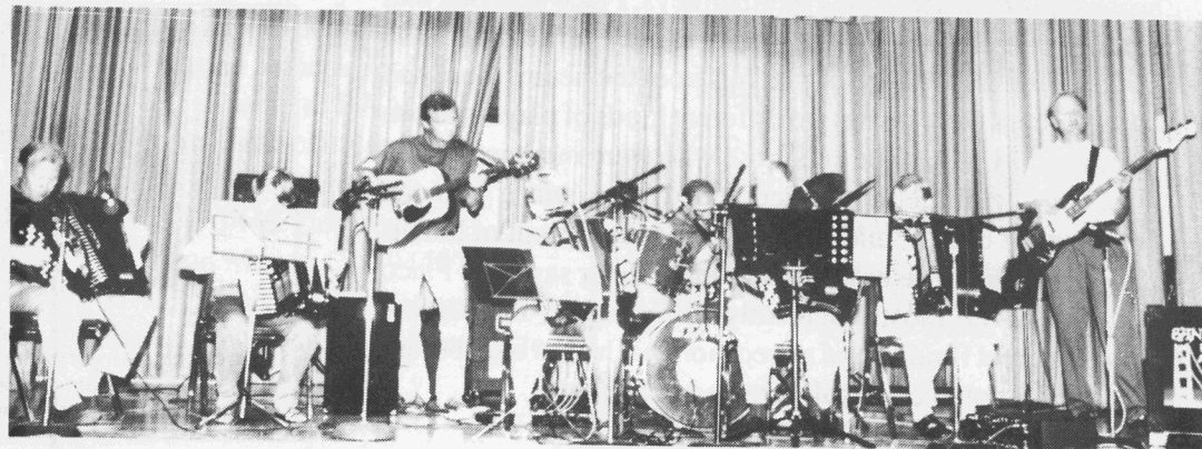
The Kil (Steel), Sweden Accordion Club

All the music teachers and band leaders in the audience must have appreciated his big plug for keeping up the correct tempo. Chuck noted that (1) if the band doesn't play the right tempo, the audience won't be back; and (2) if you don't play the