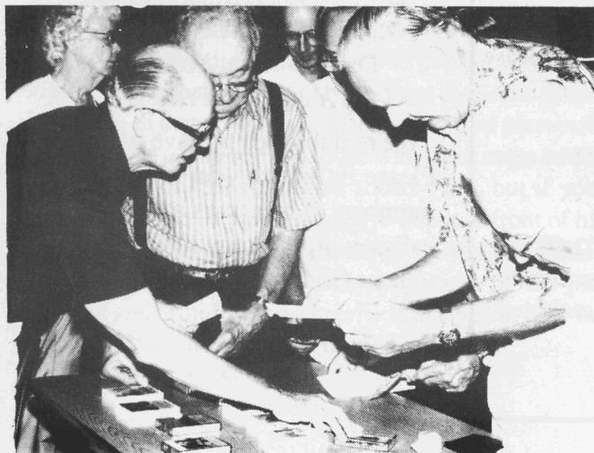
You want how many tapes??