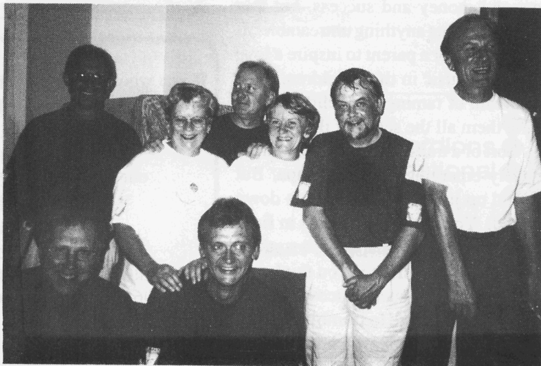
Our Viking Visitors, without accordions

Hopefully we can listen to Chinese accordion virtuosos in the future. They have never been outside China; their music should be very welcome in the western world.