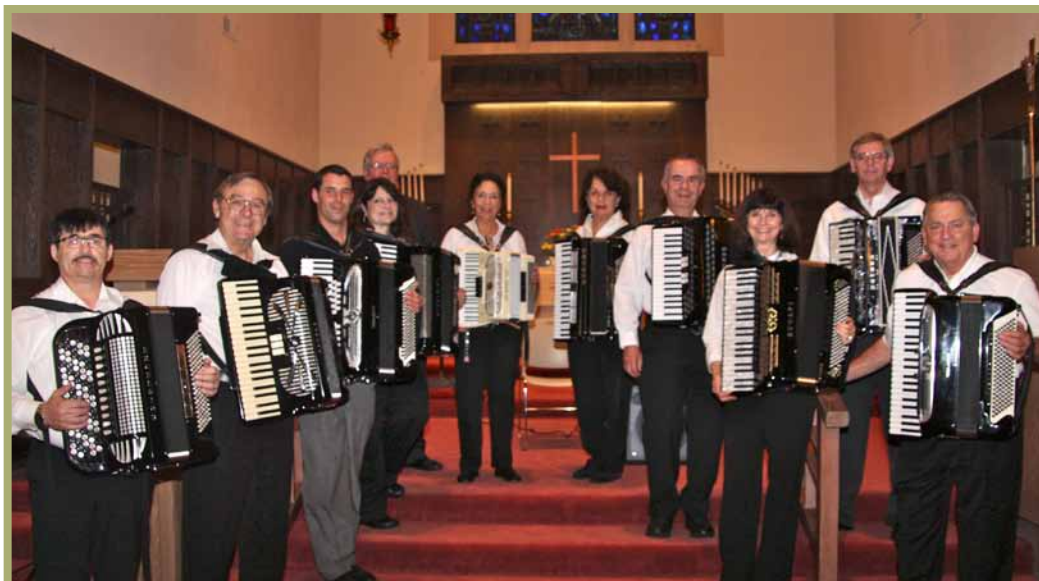
ACE, Accordion Ensemble