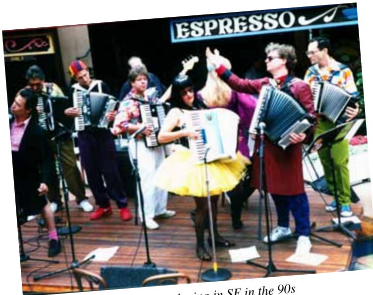
Those Darned Accordions, playing in SF in the 90s

Whiskey and Women • www.whiskeyandwomenmusic.com