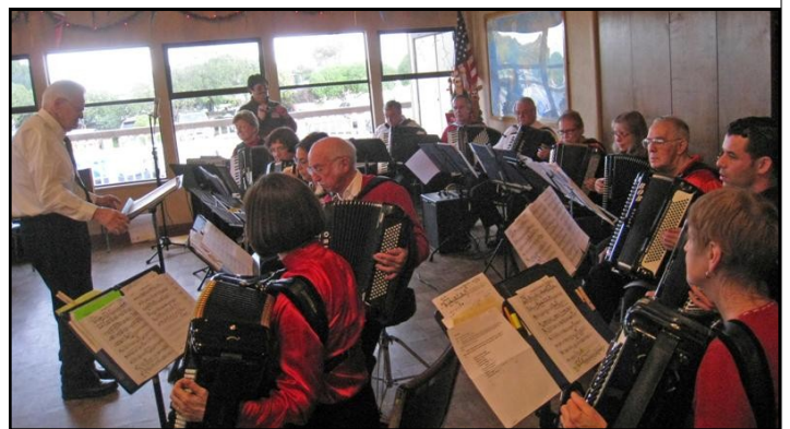
The San Francisco Accordion Chamber Ensemble!

knows how it's meant to be played, and arranged it for the ensemble as an orchestral piece, and what a sound! The other piece, of course, was Lady of Spain . We laughed when Joe gave it to us in the ensemble. Lady of Spain for orchestra? Well, I hope you were there to hear what Joe did with it. Lady of Spain is not a waltz—it is a Paso Doble written in \frac{3}{4} time! (Many versions show it in \frac{6}{8} time too.) And Joe knew how to bring out the Paso Doble so that it sounded straight out of Spain! ¡Olé!