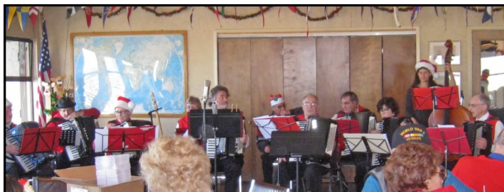
The San Francisco Accordion Band