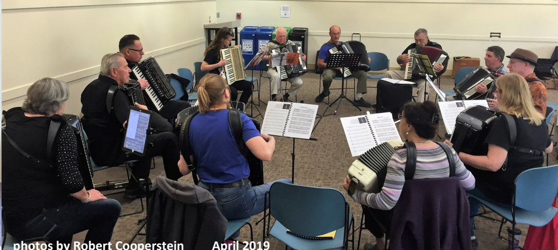
April 2019