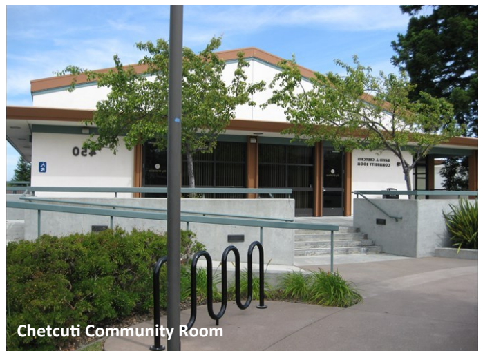
Chetcuti Community Room