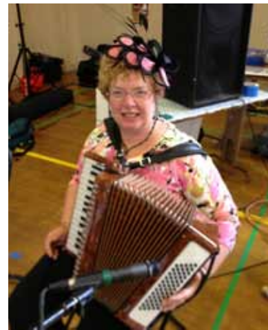
Musician at SF Folk Festival 2013