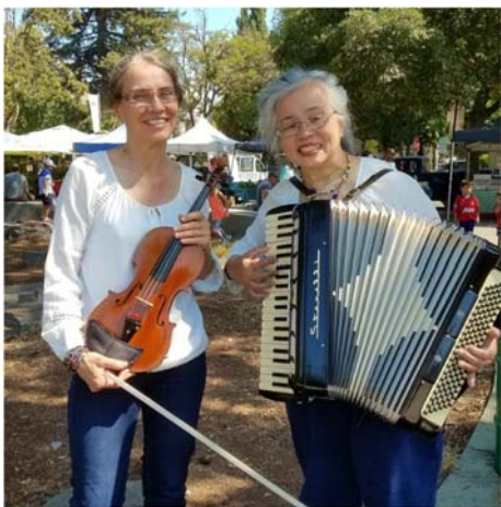
Fiddle & Squeeze Musique

SFAC members are invited to list Greater Bay Area performances in our newsletter. Send print-ready information, 50 words or less (per event), at least 6 weeks in advance, to rosemary@busher.org . Size and detail of notice will depend upon space available.