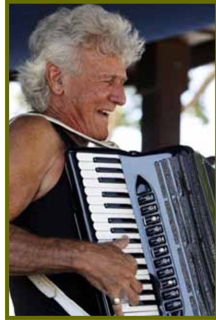
Dick Contino the legend