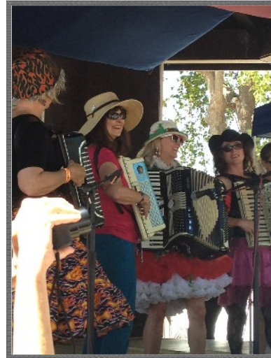
Lady of Spain-a-thon!